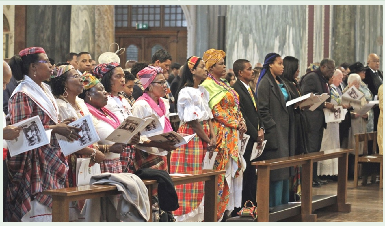
Dominicans celebrate Dominica's 40<sup>th</sup> Anniversary of Independence, at the Westminster Thanksgiving on Saturday 27<sup>th</sup> October 2018.

More information and photographs from the Thanksgiving Mass will be issued shortly.