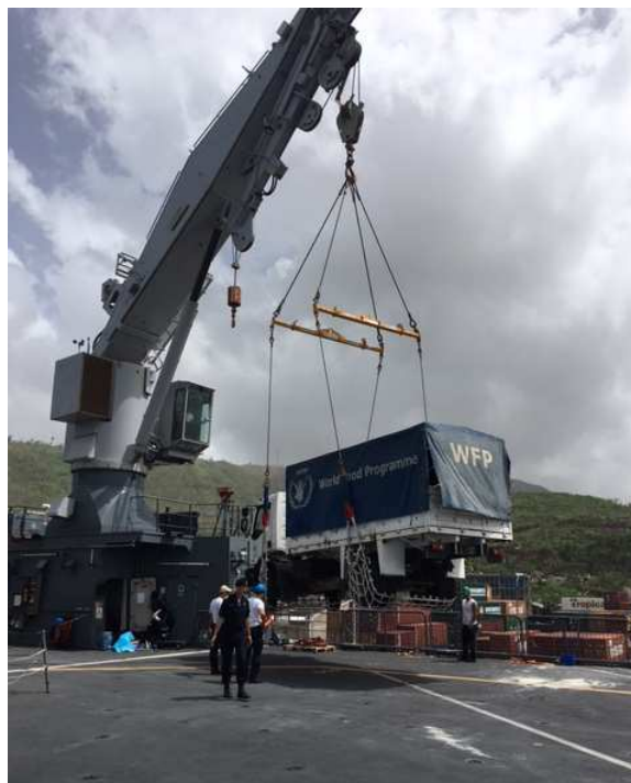
WFP truck being offloaded at the Roseau port on 19 October.