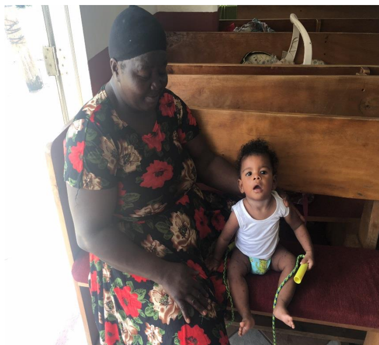
Hurricane Maria displaces in a shelter in Roseau.