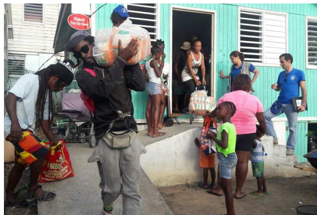
WFP food distribution in Coulibistri